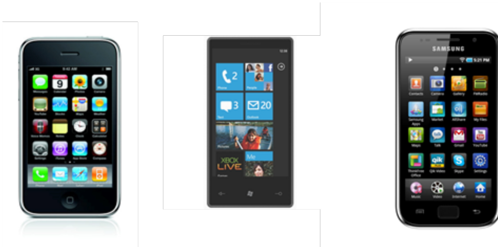
Figure 2: Platform architectures match: smart phones. From left to right: iPhone, Windows Phone, Samsung.

Finally convergence and its impact on human online activity on mainstream platforms is fundamental but it is not an exclusive phenomenon in new media. Several new online services come out day by day. One of the most dynamic areas has been the downloading applications for smart phones and media tablets: Apple App Store surpasses 40 billion downloads at the beginning of 2013 (Apple, 2013). Or there is another field: global systems (e.g. Groupon, Wikipedia) also set up a claim for local, professional, special, individual tools.