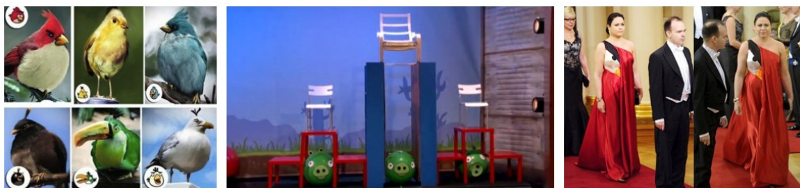
Figure 3: Angry birds app game, fashion and live show.

The globally famous game, “Angry birds” is a transvergent media platform for interactivity and collaboration with users, companies – their networks included –, contents and offline/online tools. The curriculum service, the crossmarketing with IKEA promotion/interior, fashion design via one Angry birds element are extensions of the original media platform (Figure 3).